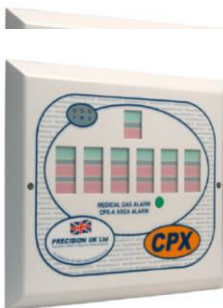
Area Alarm Unit