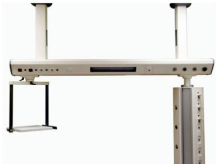
CIELO - CEILING MOUNTED