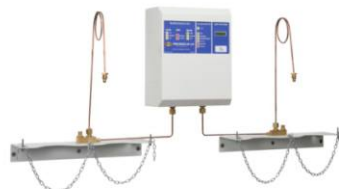
Medical Gas Manifolds