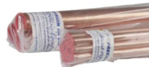
Degreased Medical Copper Tube